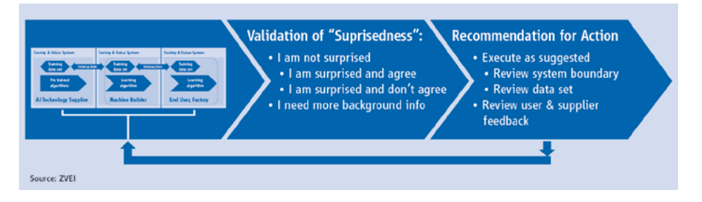
Feedback loops triggered by the Human in the loop when validating levels of surprisedness

Integrating the human in the loop by applying the new metric of "surprisedness" in above scheme we can differentiate the type of interactions between each system boundary encompassed in the value chain from supplier to integrator to factory. Further we have the information which will allow to develop an AI-system to resolve the human state of surprise.